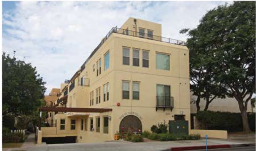
Suite Entry off of Irving Place

Parking: Three reserved spaces at $120/space/month